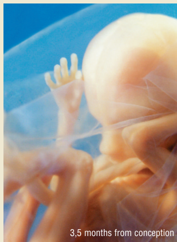
3,5 months from conception