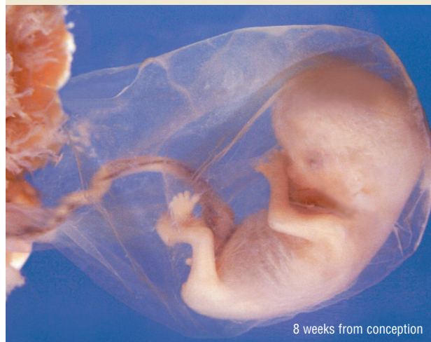
8 weeks from conception