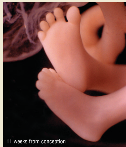
11 weeks from conception